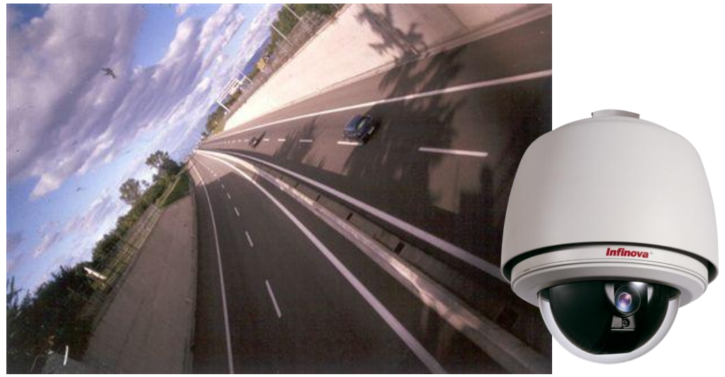
Solution: Infinova V1749 high-speed PTZ dome cameras with 35x zoom and fiber optic transmission

Infinova and GSG International increased safety and security on one of Italian's most important motorway links.