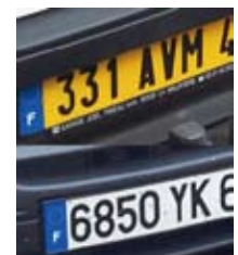
Image cropping, people counting, object tracking, tampering detection and exposure modification of portions of a video picture also are possible. Some surveillance cameras include metadata about what is shown in the video, provide the time and date when the video was recorded, and perform facial and license plate recognition, to name a few.

Of course, how smart a camera has to be is a function of each individual application. Still, having intelligence in the camera – that is, at the edge – enables quick set up without heavy reliance on network resources. Cameras do not need to have expanded intelligence inside, however. Intelligence can also reside in encoders in the case of analogs, in storage devices and through analytics software in video management systems.